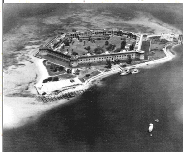
Historic American Buildings photo.

Ron Ralph will tell us the story of Fort Jefferson, the largest masonry structure in the western hemisphere. The fort is located in the remote and isolated Dry Tortugas, 70 miles west of Key West.