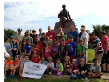
Stephen F. Austin Monument at San Felipe