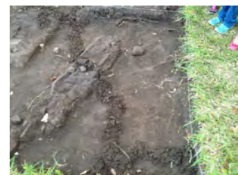
Mole makes mess of our unit, not once but twice!